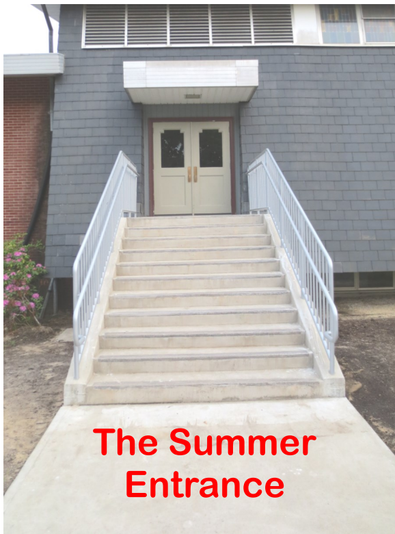
The Summer Entrance

The only realistic option is keeping the Mass schedule for those who can come in by the side stairways. The contractor is the same one we used for the side steps and the rail fabricator already has the specs. We are hoping that the summer months will be enough time to have a new entrance installed (which will not be a bridge). We will keep you informed.