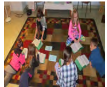
Catechetical Sunday ~ Hospitality