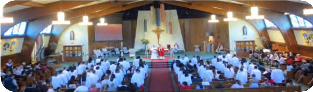
First Holy Communion