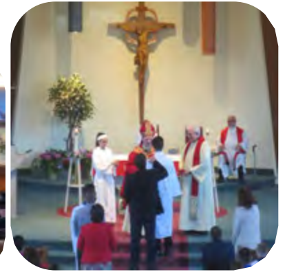
First Communion Retreat